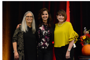
Susie Carter Mixed Media Creations