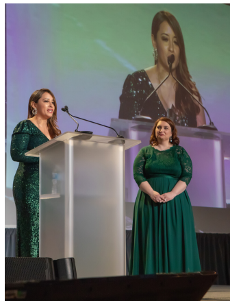
Heads or Tails